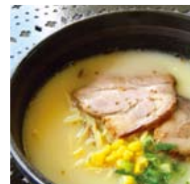
Paitan – Creamy Milky White ramen made from scratch.

LOCATION: Ward Warehouse TEL: 808-591-8855 URL: www.currykinghawaii.com CREDIT CARD: VISA MC JCB DISCOVER STORE HOURS: Mon to Sat 10am – 9pm Sun 10am – 6pm