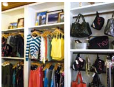
All the latest Roxy surf fashions for girls at reasonable prices.

LOCATION: Ward Warehouse TEL: 808-596-2773 CREDIT CARD: VISA MC JCB AMEX DINERS DISCOVER STORE HOURS: Mon to Thu 10am – 9pm Fri & Sat 10am – 10pm Sun 10am – 7pm