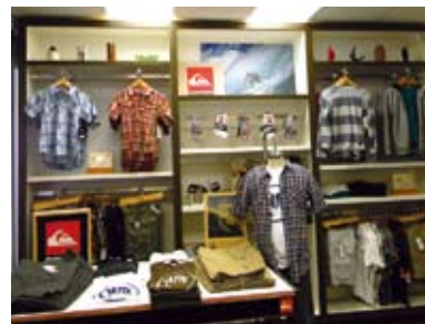
Hawaii's largest selection of Quiksilver for boys, from infant to teenager.