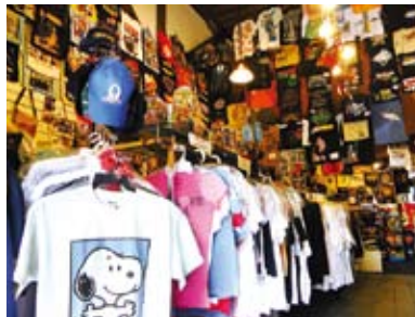
Shop interior: covered with T-shirts.

Hawaii's largest selection of T-shirts, from famous characters to local designs to even custom looks. For custom printing right in the store, there are many choices to make including shirt color, size, style, front versus back printing and a wide variety of print selections!